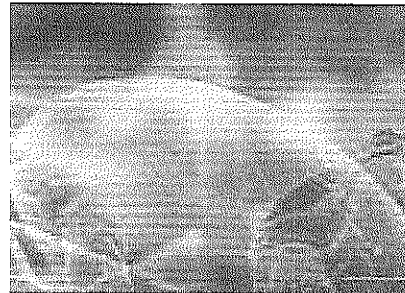
Magnified photo of the human head louse and louse egg (nit).

Head lice need to maintain contact with a host in order to survive. Those lice that leave the host voluntarily, or fall off, are likely to be damaged or approaching death (their life span is about 3 weeks) and so unable to start a new colony. There is no need to wash or fumigate clothing or bedding that comes into contact with head lice.